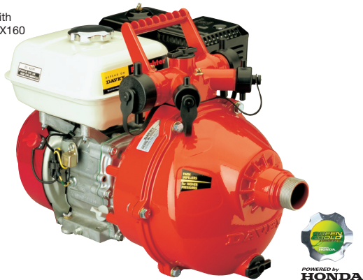
5255H with Honda GX160 Engine

All engines conform to the tough environmental requirements of the USA EPA and CARB standards, to help look after the environment.